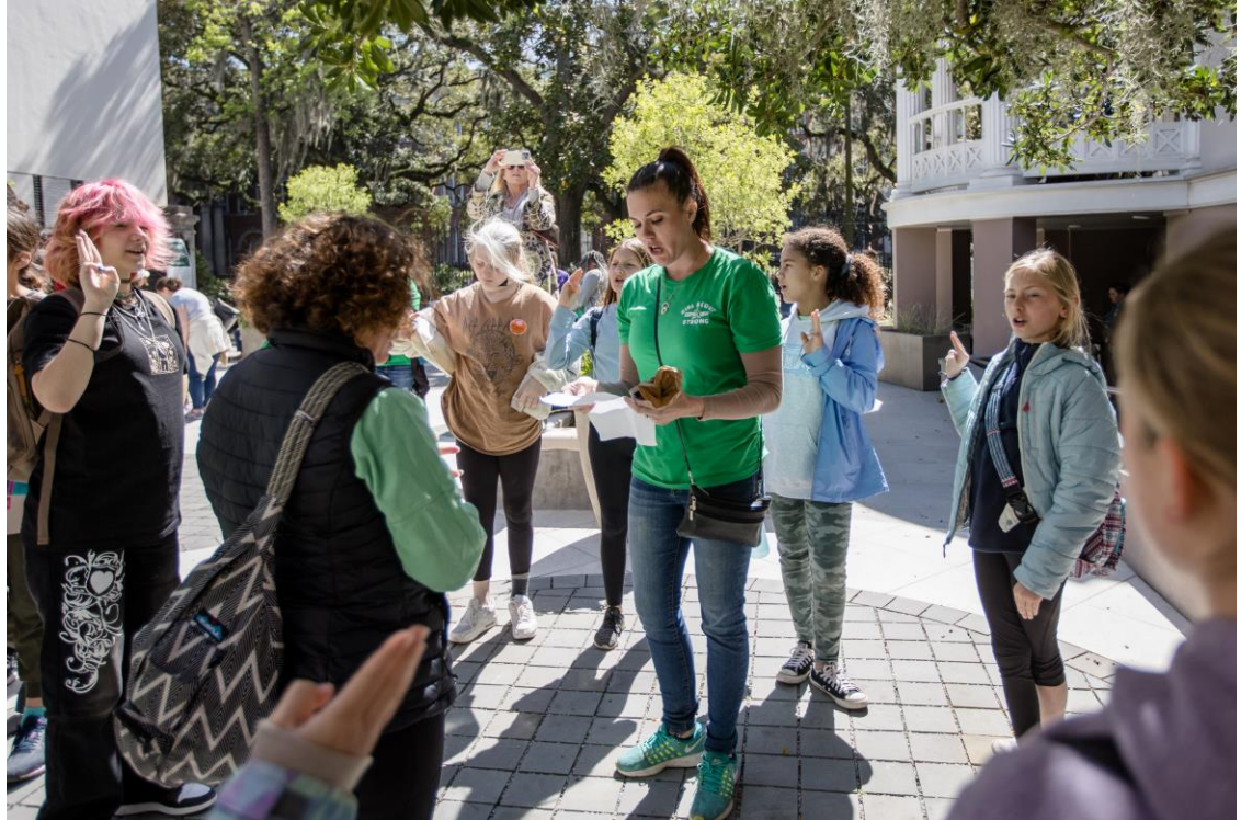
The image shows a Girl Scout troop saying the Girl Scout Promise during their Girl Scouts' Own Ceremony in the museum garden.

Your troop may choose to sing, dance, say a few words, or have a quiet moment together.