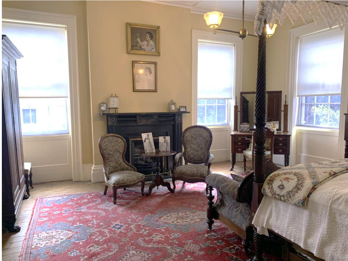
The image shows Juliette Gordon Low's bedroom with furniture and artwork that belonged to her. It is all over 100 years old.

There are guidelines to keep the house safe.