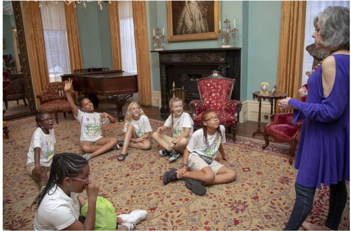
The image shows a Girl Scout raising her hand to ask the museum guide a question while she sits on the floor with her troop in the parlor, a room for entertaining friends and family.