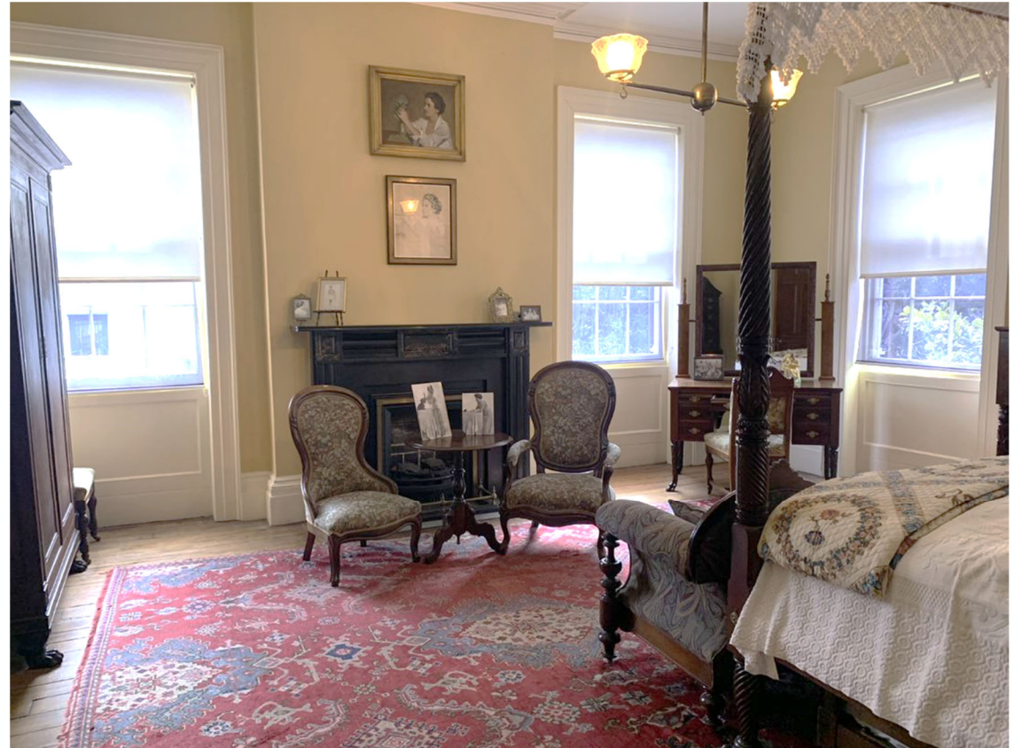
The image shows Juliette Low's bedroom with furniture and artwork that belonged to her. It is all over 100 years old.

There are guidelines to keep the house safe.