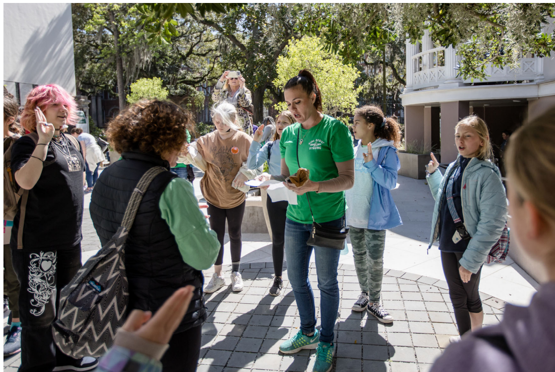
The image shows a Girl Scout troop saying the Girl Scout Promise during their Girl Scouts' Own Ceremony in the museum garden.

Your troop may choose to sing, dance, say a few words, or have a quiet moment together.