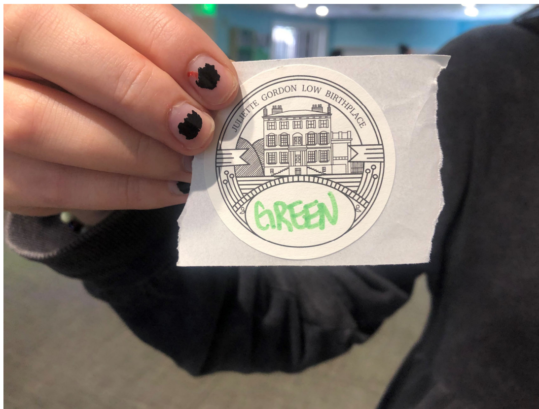
The image shows an example of a troop experience ticket for someone in the Green group.

The colors help museum guides know who is in each group.