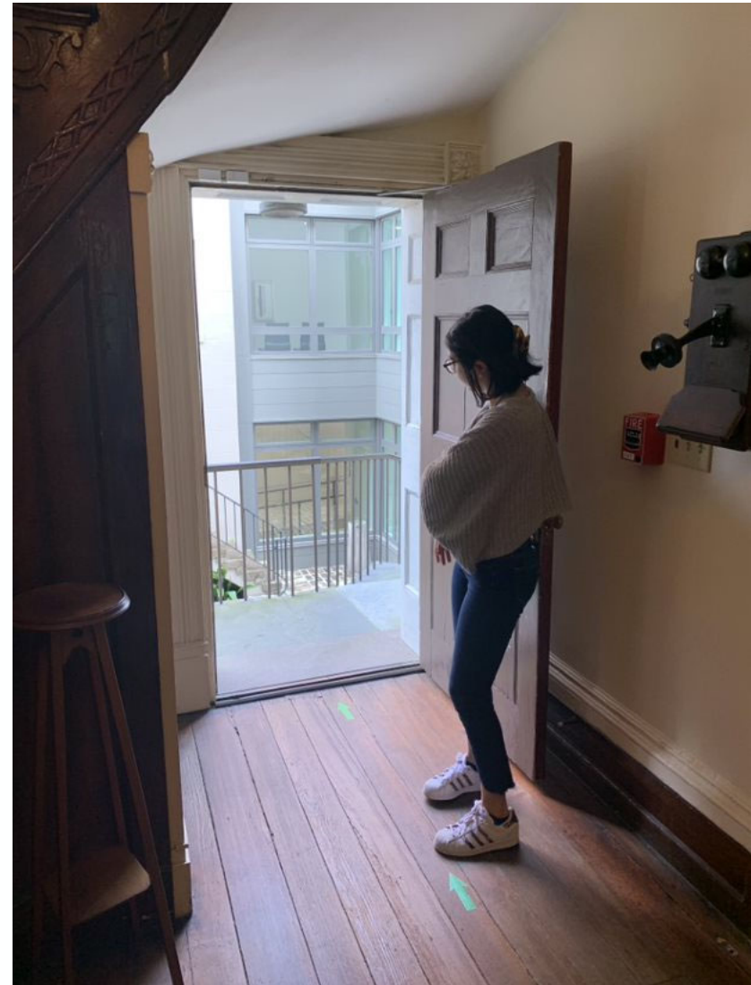
Image shows a museum guide holding the door open for visitors who choose to use the stairs to exit.

Thank you for visiting the Juliette Gordon Low Birthplace!