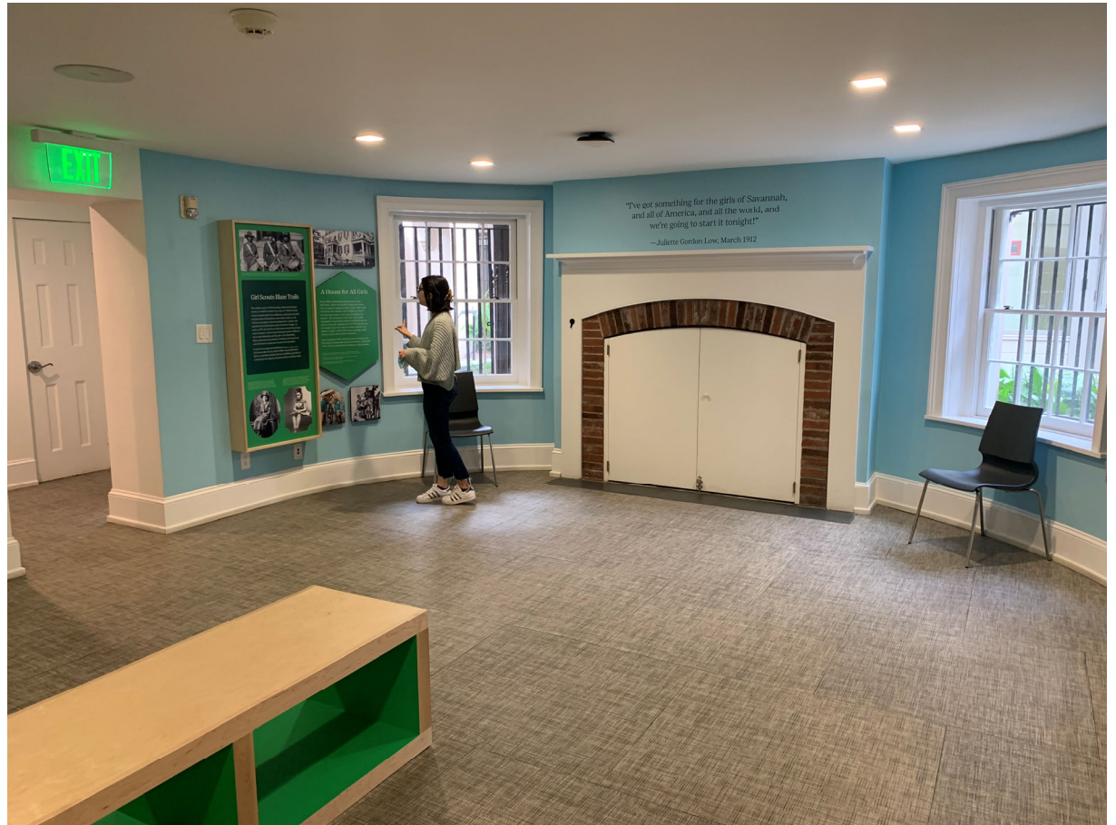
The image shows someone in the basement gallery reading information and looking at photos on a gallery wall.

There are bathrooms and a water fountain in the gallery, and places to sit if you need a rest.