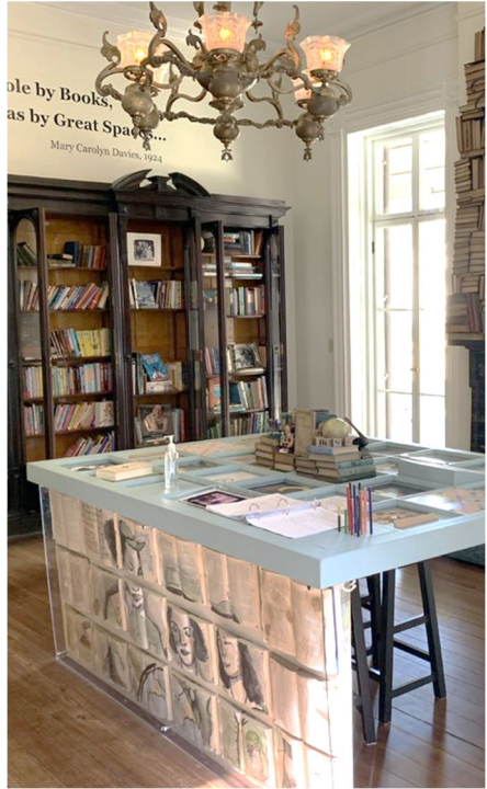
The images show the curving stair rail, a gray plastic chair for sitting, and the library room with bookcases and an activity table.