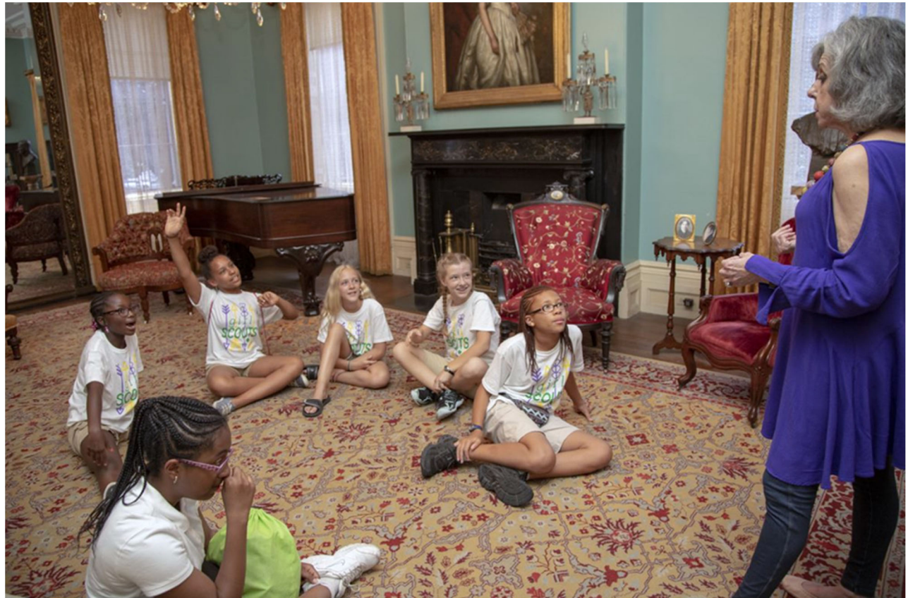
The image shows a Girl Scout raising her hand to ask the museum guide a question while she sits on the floor with her group in the front parlor, a room for entertaining friends and family.