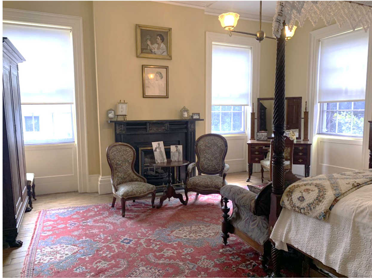
The image shows Juliette Low's bedroom with furniture and artwork that belonged to her. It is all over 100 years old.

There are guidelines to keep the house safe.