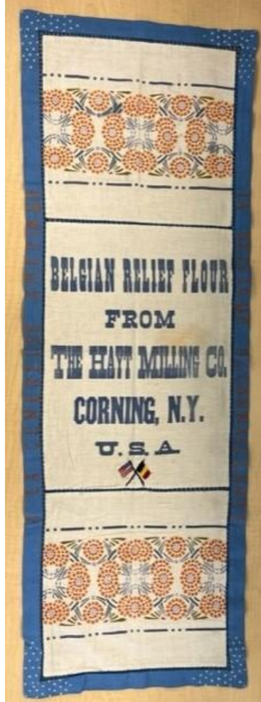
Second flour sack in GSUSA's Lou Henry Hoover collection. This one is painted and the text from the actual flour sack is visible.

Belgian Flour Sack Museum has a very similar flower design painted on it. Perhaps the same person made both.